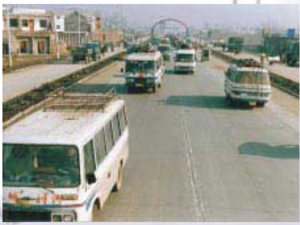
National Highway 311 (Henan Province Yong Cheng City) 國道 311(河南省永城市)