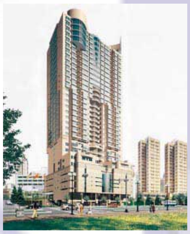
New Time Plaza, Guangzhou 廣州之新時代廣場