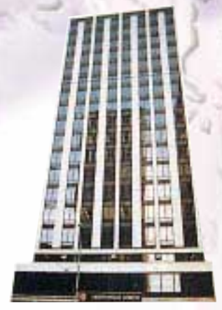
Cambridge Building, Edmonton, Canada 加拿大愛民頓市之商業大廈