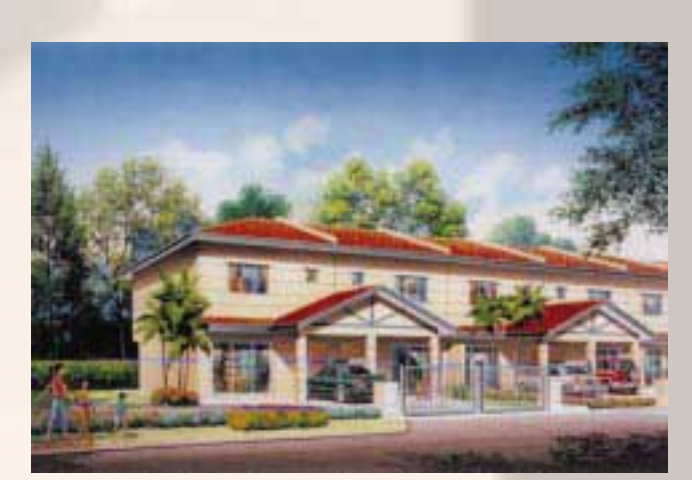
Proposed Taman Teluk Bedong Indah Development 公寓