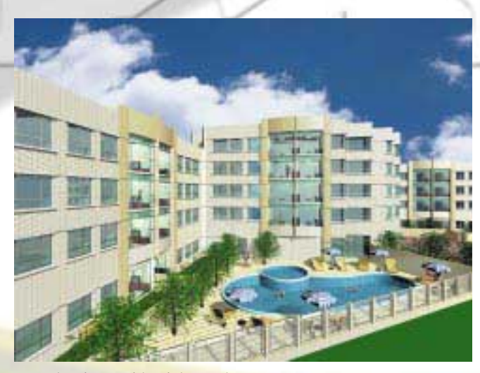
Low-density Residential Development at Tan Kwai Tsuen, Yuen Long 低密度住宅發展於元朗丹桂村