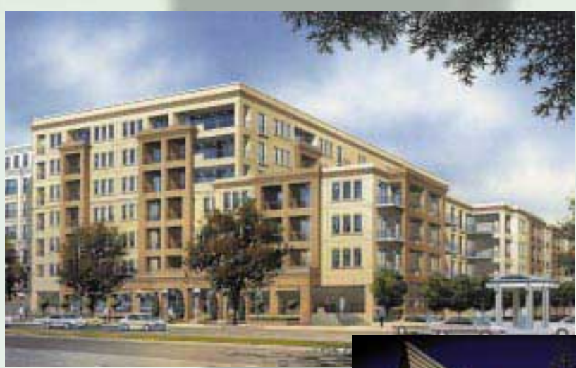
360 St. Kilda Road, Melbourne "Royal Domain Plaza Apartments" 墨爾砵之公寓