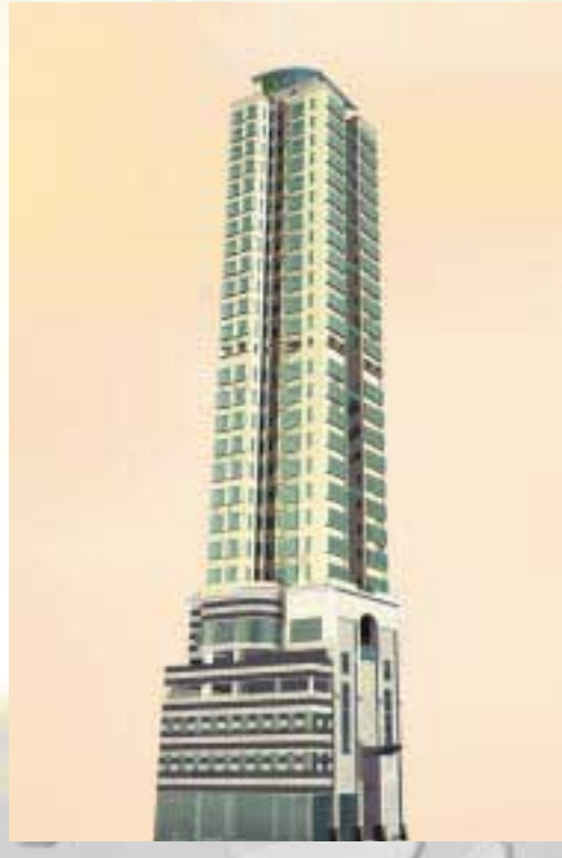
Composite Development at Baker Street, Hunghom 綜合發展大廈於紅磡必嘉街