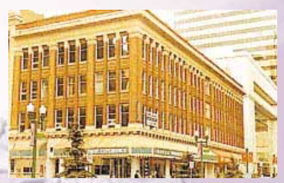
Kelly Ramsey Building, Edmonton, Canada 加拿大愛民頓市之商業大廈