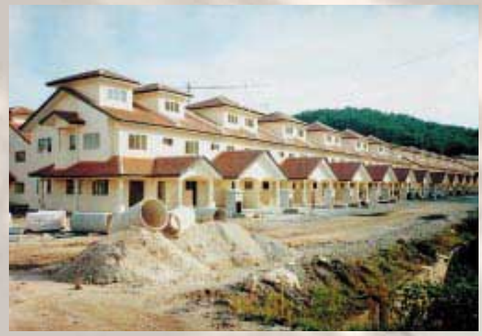
Desa Karunmas 2 ½ Storey Terrace House 住宅