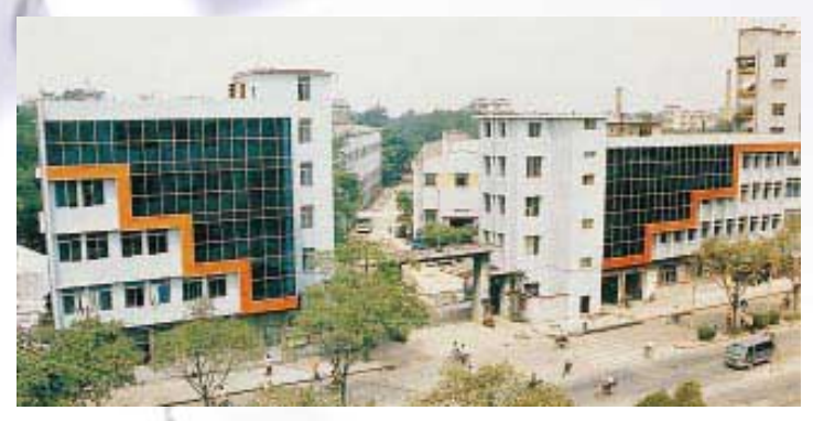
Guangzhou Pegasus Boiler Factory, Guangzhou 廣州勁馬鍋爐廠