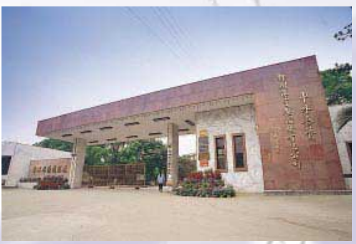
Liuzhou Universal Compressor Factory 柳州環宇壓縮機廠