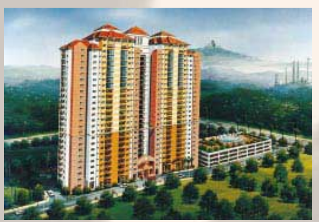
Proposed Apartments in Segambut (Planning Stage) 公寓