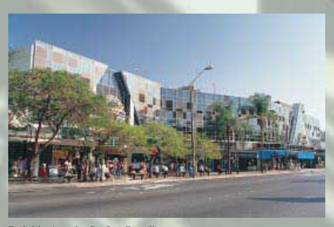
Dolphin Arcade, Surfers Paradise 滑浪者天堂之商場