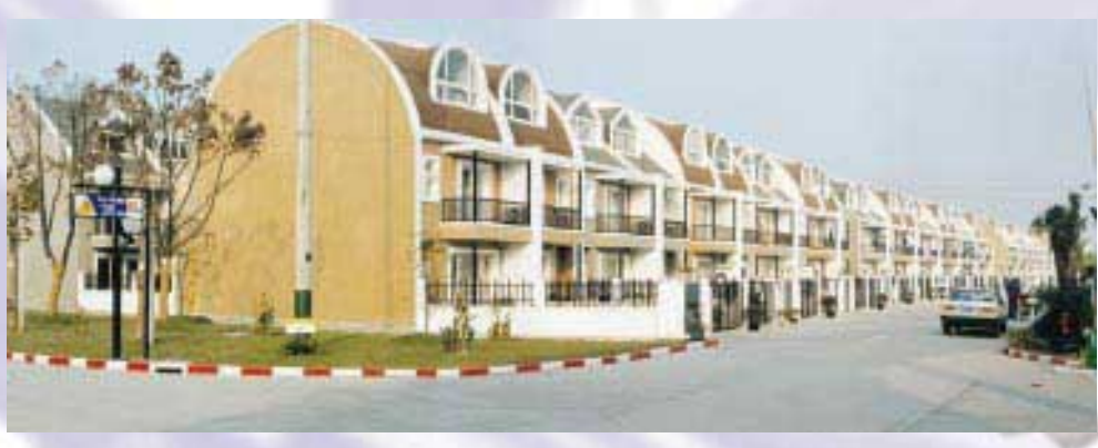
California Gardens, Shanghai (New China Homes, Ltd) 上海錦秋加州花園