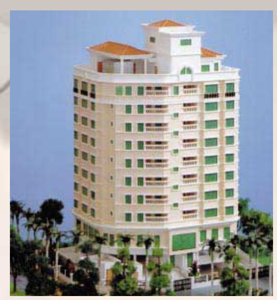
Sri Jati Condominium 公寓