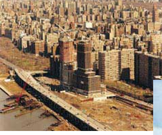
Residential Development Project at Riverside South Manhattan, New York, U.S.A. 美國紐約曼克頓區之住宅發展項目