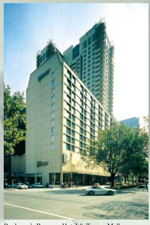
Rockman's Regency Hotel & Tower, Melbourne 墨爾砵之酒店及公寓