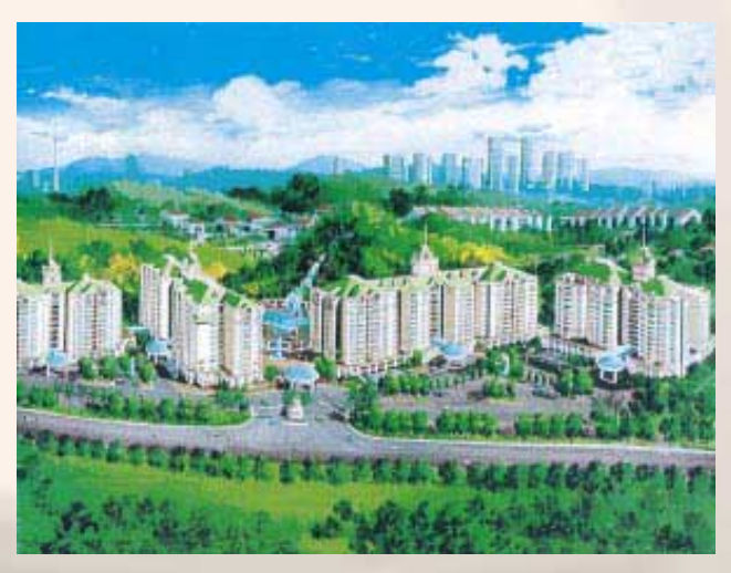
Regina Court Condominium 公寓