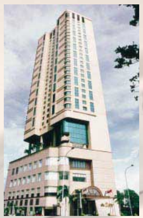
Dorsett Regency Hotel, Kuala Lumpur 吉隆坡之酒店