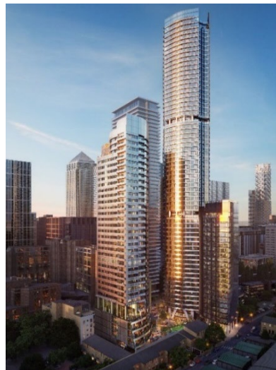
Photo Caption: FEC – Aspen at Consort Place in Canary Wharf, London

Venue: Sung Room, 4/F, The Sheraton Hotel, Tsim Sha Tsui